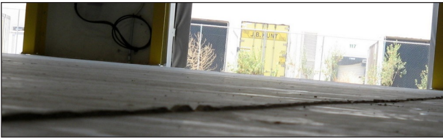
Ex. of Filler protrusion in building with no climate control

When floors expand, the difference can be measured at the joints. The same joint can be 1/4" (6.35 mm) wide in December and 1/8" (3.17 mm) wide in July. You will generally not notice the joint width change if the joints are not filled. But if the joints are filled, you can tell immediately how much the slab has expanded or contracted.