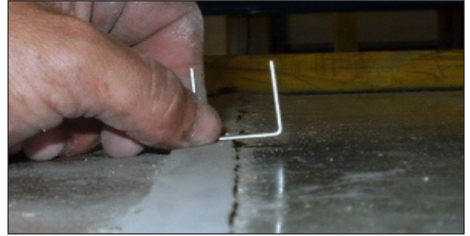
Example of filler protrusion in exposed floor

On many projects the joints are filled before the HVAC is turned on. If the joints are filled while the ambient temperature is cool, and then the heat is turned on, the increase in temperature can cause slab expansion, which in turn causes joints to narrow, causing filler extrusion.