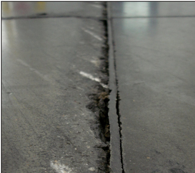
Curled slab panels create impact points for material handling vehicle wheels and joint edges along curled panels can quickly deteriorate if left uncorrected.

Curl usually reveals itself at the ends of slab panels, at formed construction joints. The ends of these panels will curl upward and outward, and the bottom of the slab will actually lift off the grade. Because all slabs shrink, all slab ends curl to some degree. The problem occurs when the curl is severe enough to interfere with the smooth flow of material handling vehicles (MHV's). If a slab end has lifted significantly off the grade, it can deflect (drop) when MHV loads are imposed. This drop is referred to as slab rocking. When one