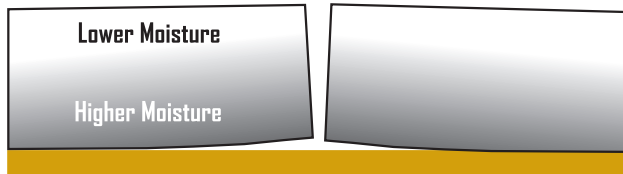
Exaggerated profile view of the slab curl phenomena

Evaporation reduces the moisture content in the upper portion of the slab, but the moisture content in the lower portion remains high. This moisture gradient variation can lead to a condition known as slab curl.