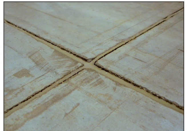
Curled or rocking slab panels can compromise the ability of the filler to provide proper edge protection.

Please contact Metzger/McGuire for more detailed information on the correction/repair of slab curl or rocking slab panel conditions.